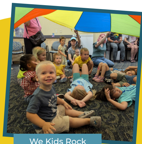
We Kids Rock

Test your spooky skills with Halloween-themed trivia! Grades 6-12.