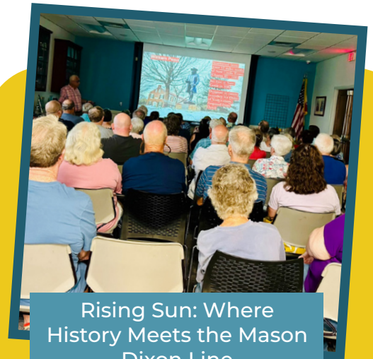
Rising Sun: Where History Meets the Mason Dixon Line