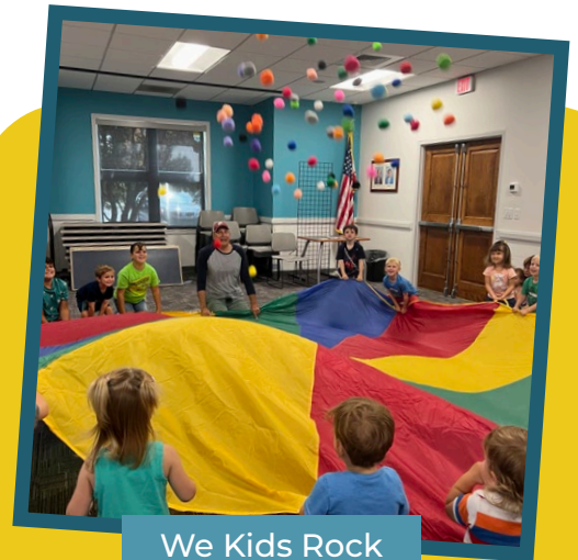
We Kids Rock

Whether you're a devoted fan of historical romance or simply curious about the magic behind these timeless stories, don't miss your chance to meet the award-winning author whose pen brings captivating romances to life.