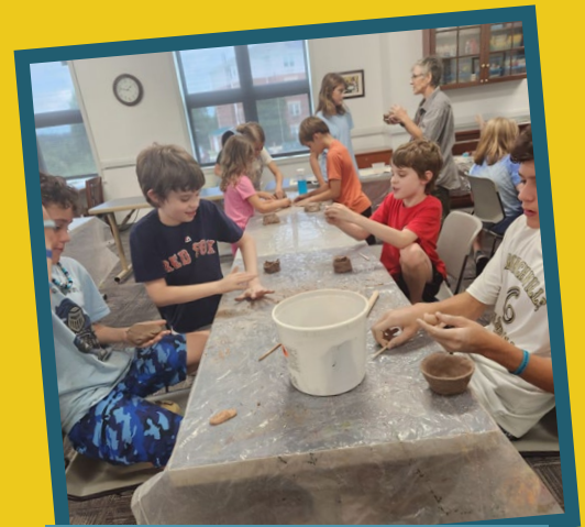
Pottery from the Ground Up